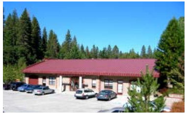
High Country Tek Headquarters in the foothills of the Sierra Nevada mountain range.